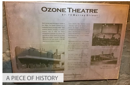
A PIECE OF HISTORY

BBG TEAM: Bay Major Projects South Australia PROJECT TYPE: Vehicle Impact Damage PROJECT SIZE: 3 Shop Fronts BUILDING TYPE: Retail PROJECT VALUE: $132k