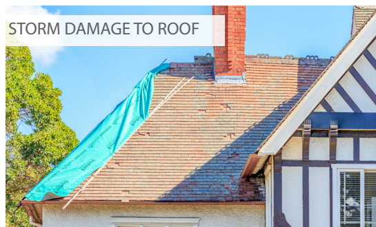
STORM DAMAGE TO ROOF

BBG TEAM: Bay Building Services PROJECT TYPE: Heritage Listed Restoration PROJECT SIZE: 105m 2 BUILDING TYPE: Heritage Listed House PROJECT VALUE: $180k