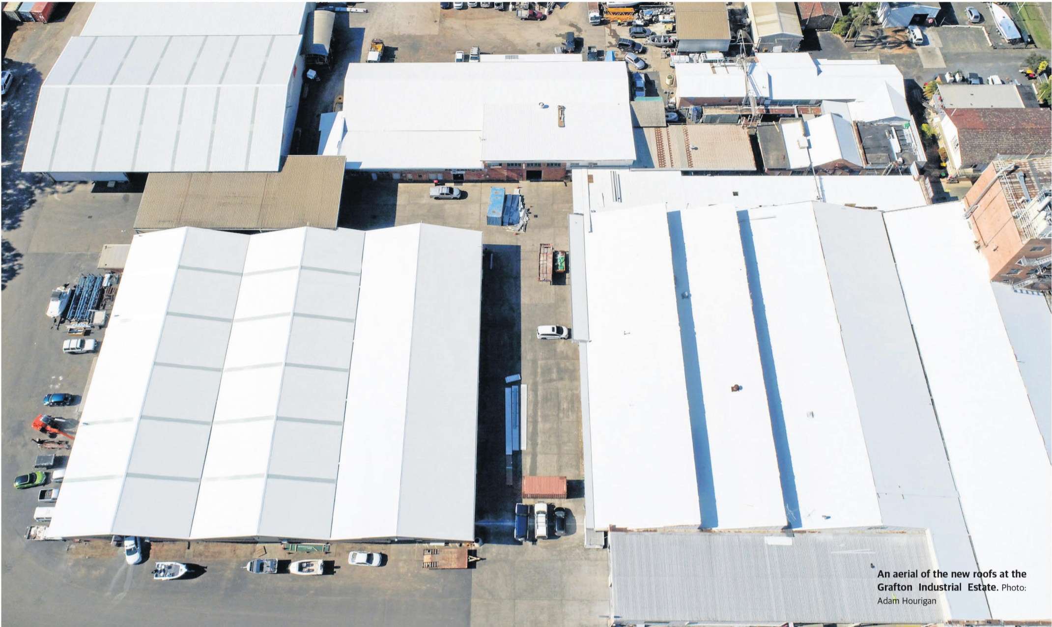
An aerial of the new roofs at the Grafton Industrial Estate.

“THE MULTI-MILLION DOLLAR REPAIR PROJECT CAUSED BY A NATURAL DISASTER IS IN THE TOP 10 UNDERTAKEN IN NSW OVER THE PAST 25 YEARS.”