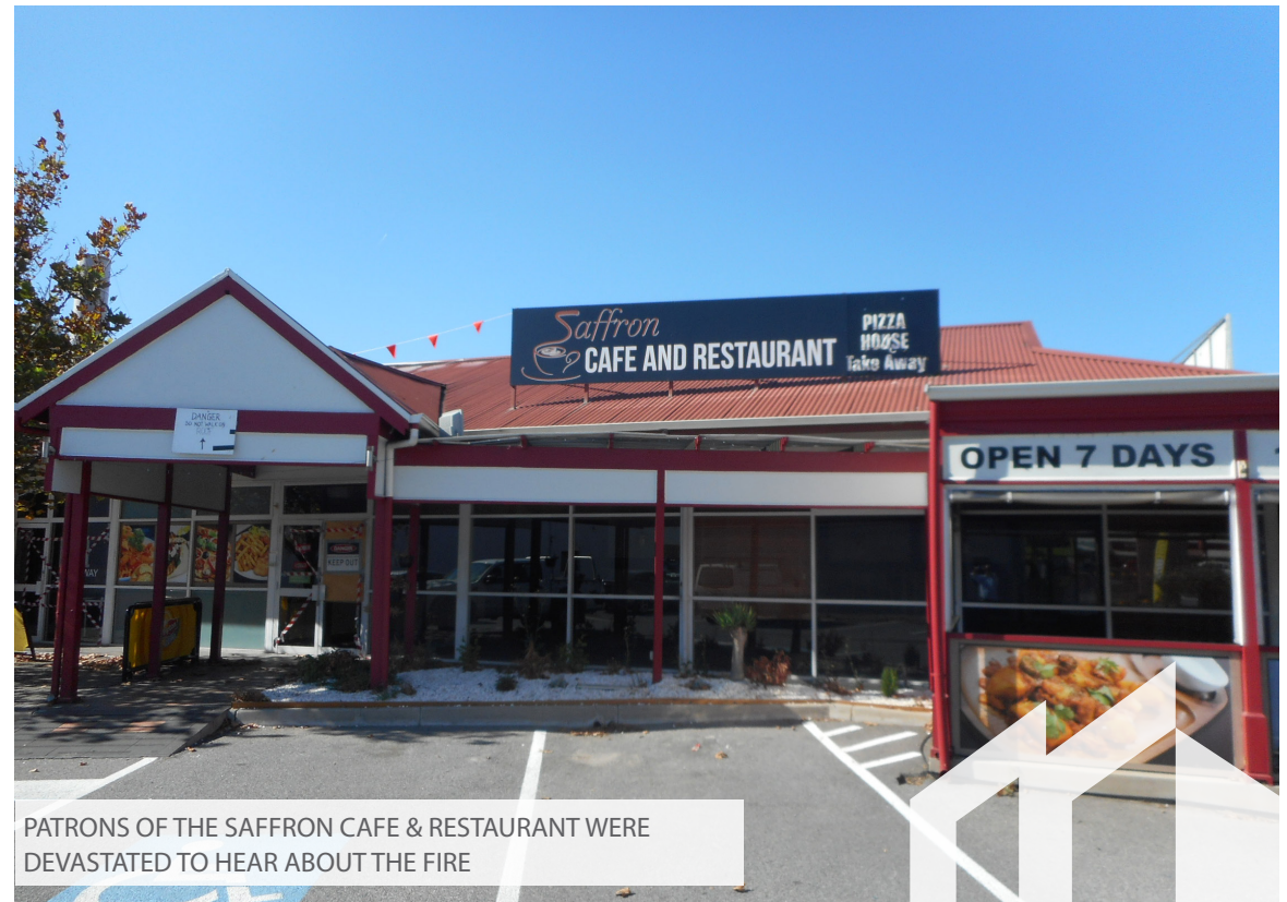
PATRONS OF THE SAFFRON CAFE & RESTAURANT WERE DEVASTATED TO HEAR ABOUT THE FIRE

The devastating blaze caused a total of 1200m2 of damage to the premises, which meant the popular restaurant was unable to trade at all during the repair and reinstatement works. The Bay Building Services team worked quickly and efficiently to ensure the rebuild ran as smoothly as possible. The project was completed within 12 weeks and delivered on time and to the exact date on the original programme.