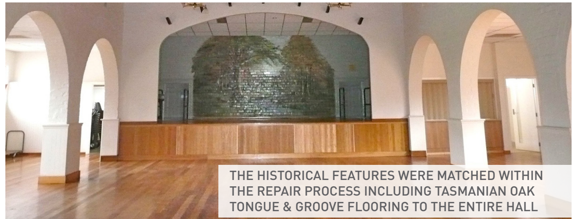
THE HISTORICAL FEATURES WERE MATCHED WITHIN THE REPAIR PROCESS INCLUDING TASMANIAN OAK TONGUE & GROOVE FLOORING TO THE ENTIRE HALL