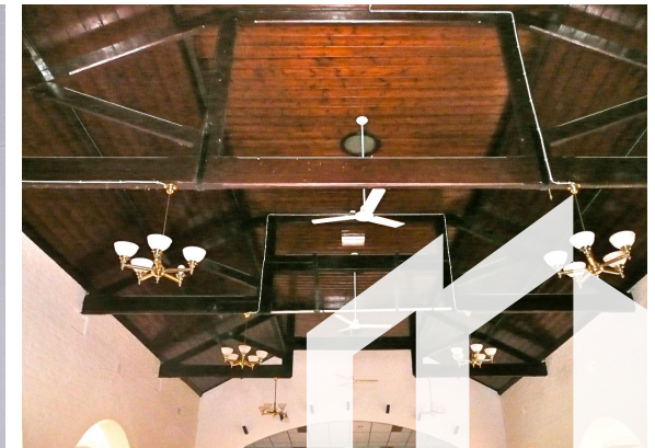
PROJECT NAME: Somerville Mechnics Institute PROJECT LOCATION: Somerville, VIC PROJECT SIZE: 480m 2 BBG TEAM: Major Projects Team