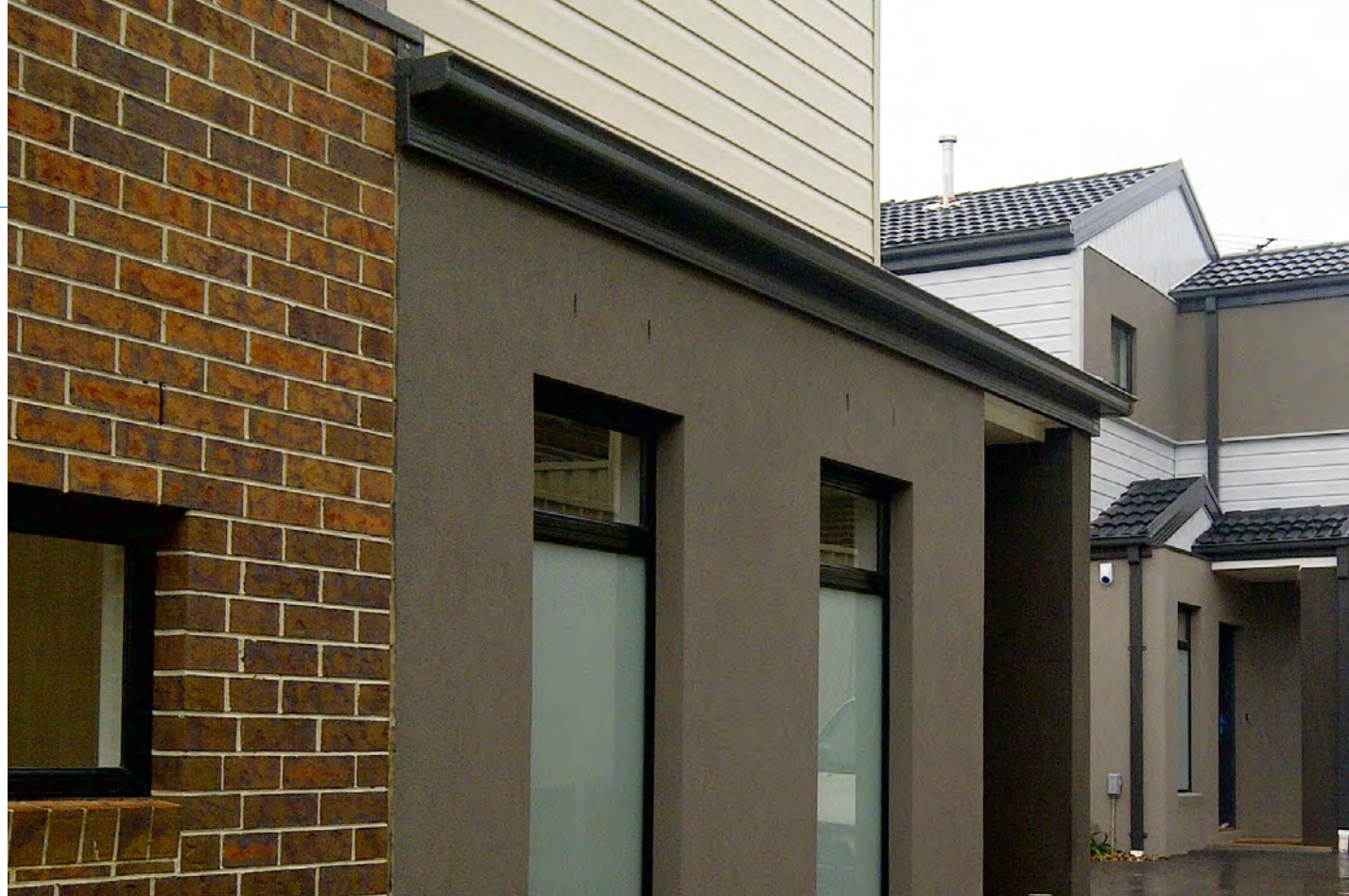
THE COMPLETELY REPAIRED AND REBUILT WESTMEADOWS TOWNHOUSES READY TO WELCOME RESIDENTS, FEBRUARY 2013

The job took five months to complete with a permanent crew of six Bay tradesmen throughout the duration of the repairs. Bay ensured that all work was programmed and carried out in the required and optimal timeframe for all parties. Upon completion of the works and after carrying out the final builders clean of the premises, the Bay crew vacated allowing the eager new residents to move into their homes.