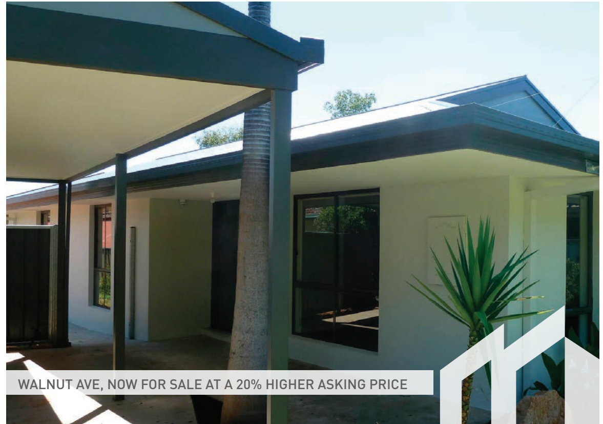
WALNUT AVE, NOW FOR SALE AT A 20% HIGHER ASKING PRICE

Upon completion of works, the owner has relisted the house on the market at an asking price almost 20% percent higher than its earlier sale price – a significant testimony to the level of care and workmanship achieved on the project.