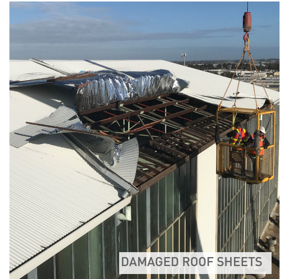
DAMAGED ROOF SHEETS