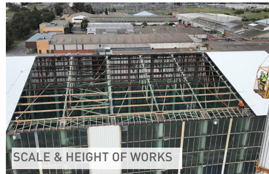
SCALE & HEIGHT OF WORKS

BBG TEAM: Bay Major Projects PROJECT TYPE: Large Scale Make Safe PROJECT SIZE: 2640m 2 BUILDING TYPE: Self Storage Facility PROJECT VALUE: $330k