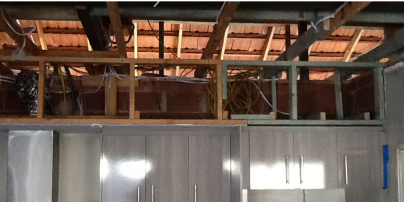
THE ROOF AND CEILING BOTH UNDERWENT EXTENSIVE RESTORATION AND REPAIRS