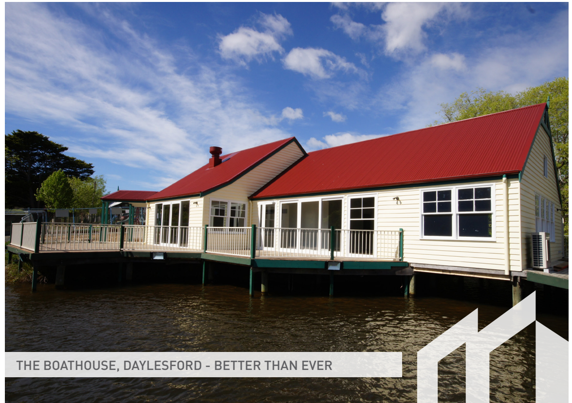
THE BOATHOUSE, DAYLESFORD - BETTER THAN EVER

Daylesford Boathouse has been reborn better than ever, with enhancements to amenities as a result of current building code requirements including internal toilets, wheelchair accessibility, and improved environmental sustainability. It has been a privilege for our team to work on such a special and unique heritage project and to have delivered an exemplary standard of work within time and budget constraints, to the acclaim of all stakeholders.