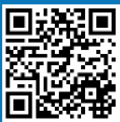
Bay Building Services Policies

24HRS 1300 766 216 baybuildinggroup.com.au