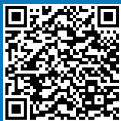
HIA Covid 19 Guides

NEED MORE INFORMATION ABOUT COVID-19 MANAGEMENT? SCAN HERE